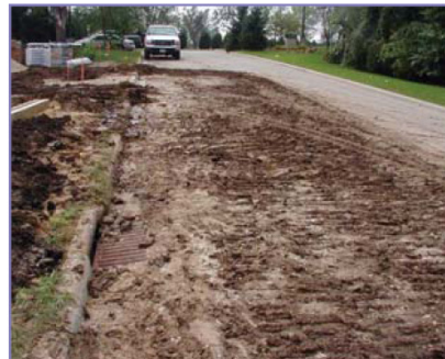
Without a proper entrance, sediment was tracked into the street and inlets carry sediment to the river.

◆ Immediately clean up tracking in streets with brooms, shovels, or a skid loader. Do not use water to clean pavements.